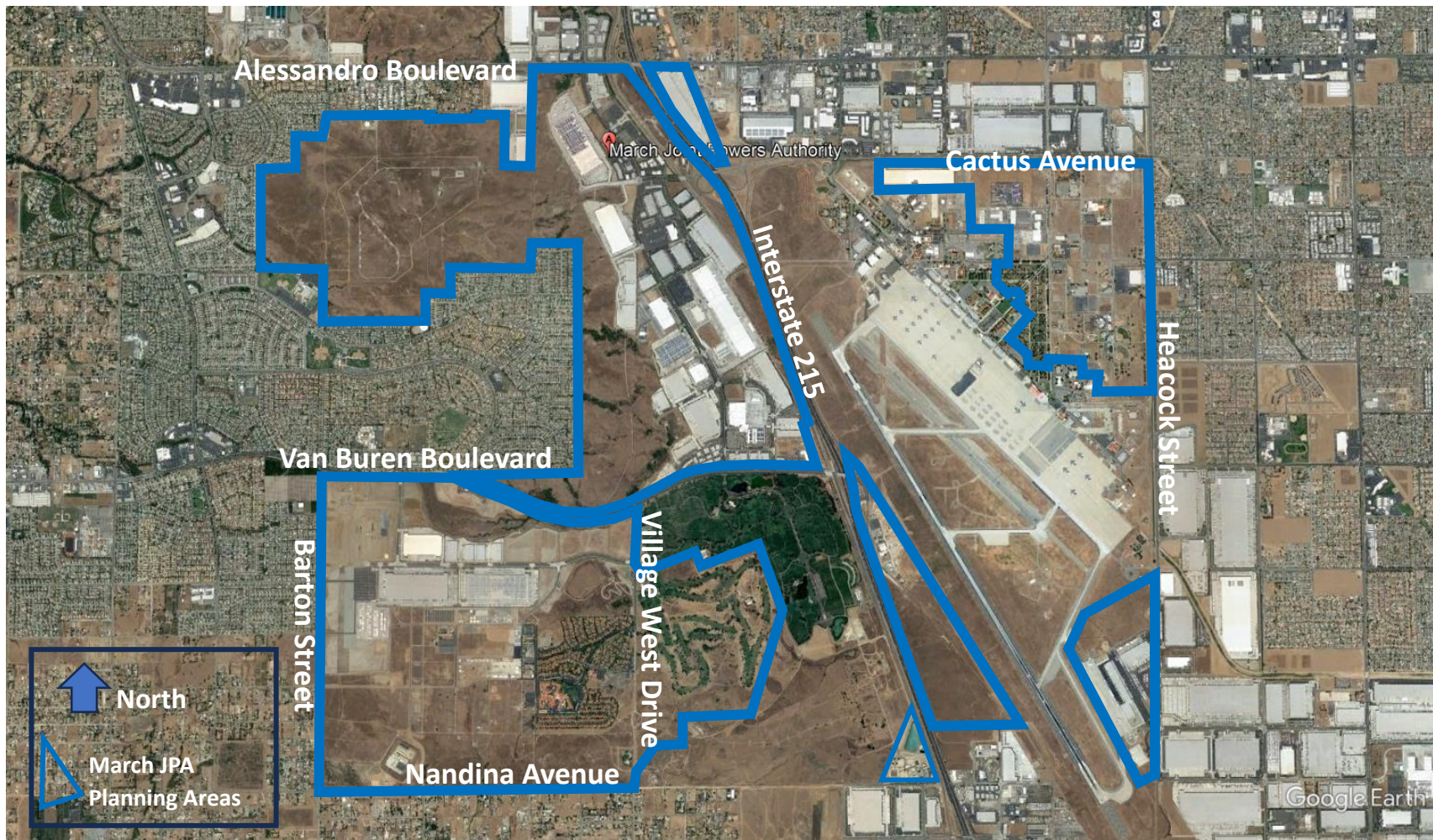
Exhibit 1: Project Location (March JPA Planning Area)

Approximately 4,400 acres of the former March Air Force Base now within the March Joint Powers Authority