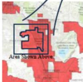
Census Tract 6065046700