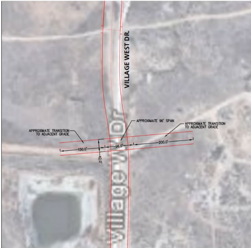
EXHIBIT 1: VILLAGE WEST EXTENSION WITH OVERPASS/UNDERPASS